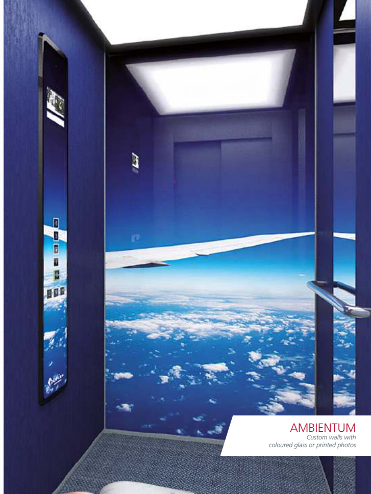
AMBIENTUM Custom walls with coloured glass or printed photos