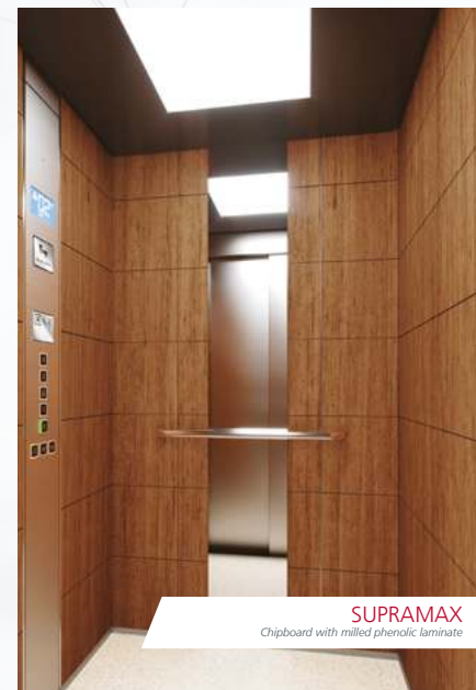
SUPRAMAX Chipboard with milled phenolic laminate