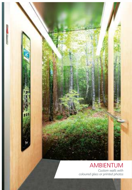
AMBIENTUM Custom walls with coloured glass or printed photos