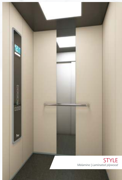
STYLE Melamine | Laminated plywood