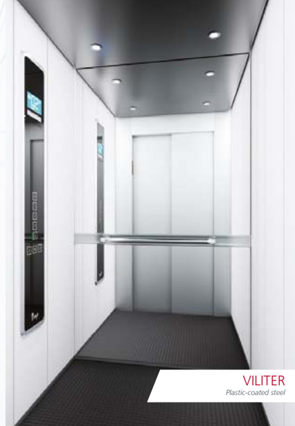
VILITER Plastic-coated steel