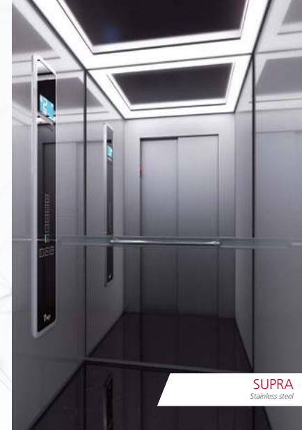
SUPRA Stainless steel