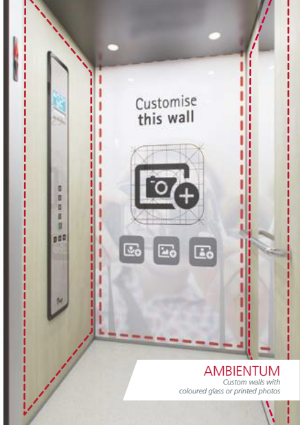
AMBIENTUM Custom walls with coloured glass or printed photos